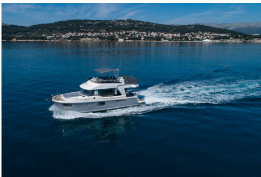
*** equipped with generator and A/C ** equipped with A/C (only on 220V)